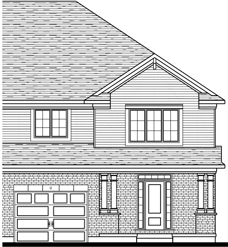
RIDGEMILL (ESSENTIAL SPECS) LOT 44B (#12) HEMLOCK CRESCENT FRONT ELEVATION 9' MAIN FLOOR CEILING APPROX. 1,921 SQ. FT.

This plan is the property of Hajjara Homes and any reproduction of this plan, its concepts or ideas, is strictly prohibited. Plans and specifications are approximate and are subject to change without notice. Finished area and room dimensions will change depending on front elevation selection. E.A.O.E. 2024 CREATED JUN. 2024