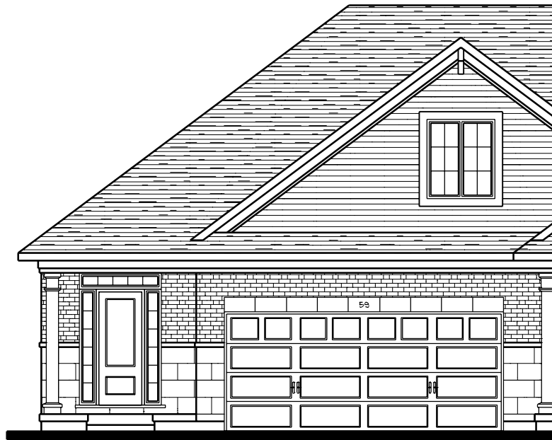
BENNINGTON (PREMIUM SPECS) LOT 1A (*59) WILLOW DR. FRONT ELEVATION 9' MAIN FLOOR CEILING$ APPROX. 1,979 TOTAL SQ. FT.

This plan is the property of Hayhoe Homes and any reproduction of this plan, its concepts or ideas, is strictly prohibited. Plans and specifications are approximate and are subject to change without notice. Finished areas and room dimensions will change depending on front elevation selection. E.A.D.E. 2024 CREATED MAR. 2024